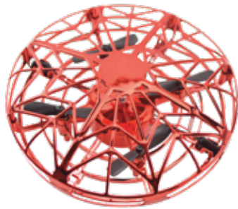
Interactive UFO Drone